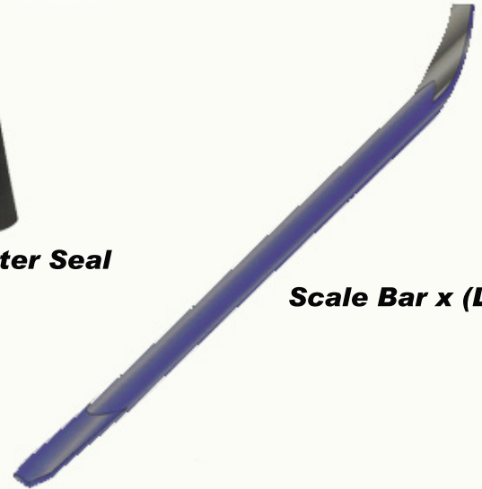
Scale Bar x (L)