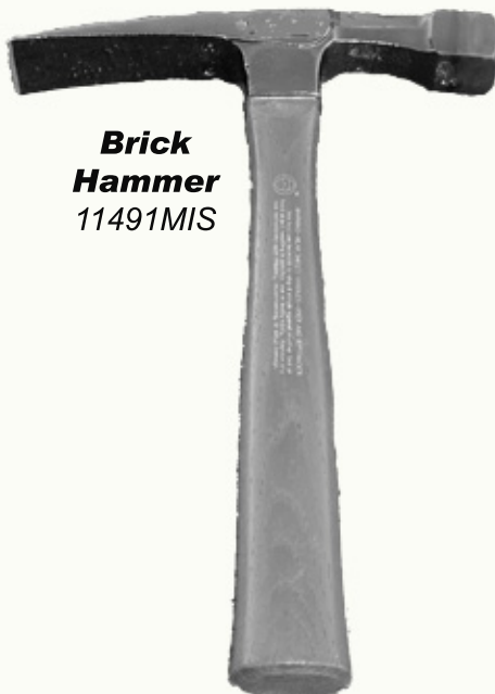
Brick Hammer 11491MIS