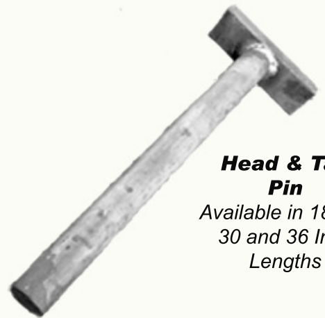
Head & Tail Pin Available in 18, 24, 30 and 36 Inch Lengths