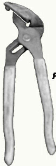
PBW Bit Puller