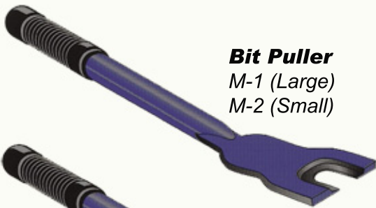
Bit Puller M-1 (Large) M-2 (Small)