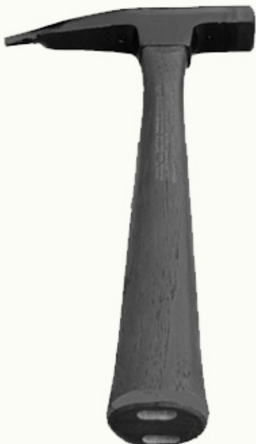
Miner's Hammer 11493MIS