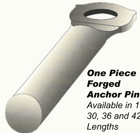
One Piece Forged Anchor Pin Available in 18, 24, 30, 36 and 42 Inch Lengths